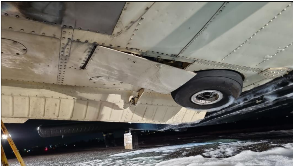
Figure 4: Main landing doors were found intact with no signs of scrape marks on the outside.