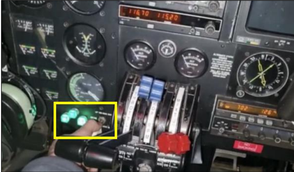
Figure 3: The landing gear in a down and locked position during the test with the three green lights illuminated.