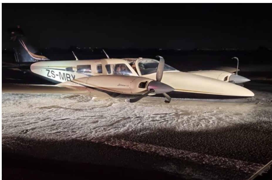
Figure 1: The aircraft post-accident.

The ARFF dispatched to the accident scene. Although there was no smell of fuel and smoke and no indication of fire, the ARFF sprayed foam on and around the aircraft as a precautionary measure. The aircraft sustained substantial damage to the underbelly, both propellers, flaps and both engines. None of the pilots was injured.