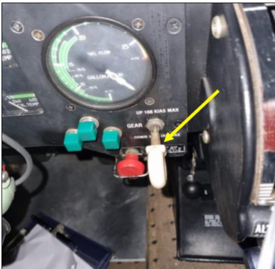
Figure 2: The arrow shows the position of the gear control switch as found post-accident.