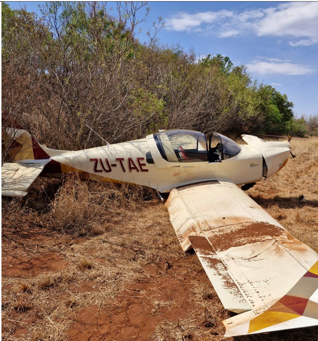
Figure 2: The aircraft as it came to rest.

An official weather report was obtained from the South African Weather Service (SAWS) that was issued for FATI on 8 October 2024.