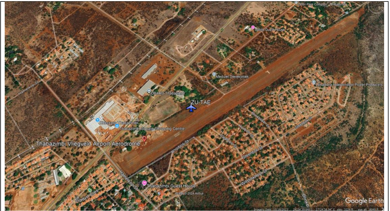
Figure 1: An overview of FATI and the accident site.