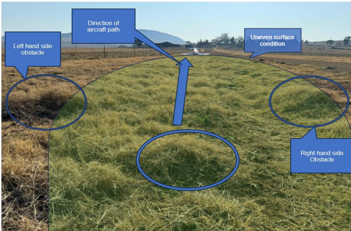
Figure 4: The uneven surface on which the aircraft rolled after it had landed.