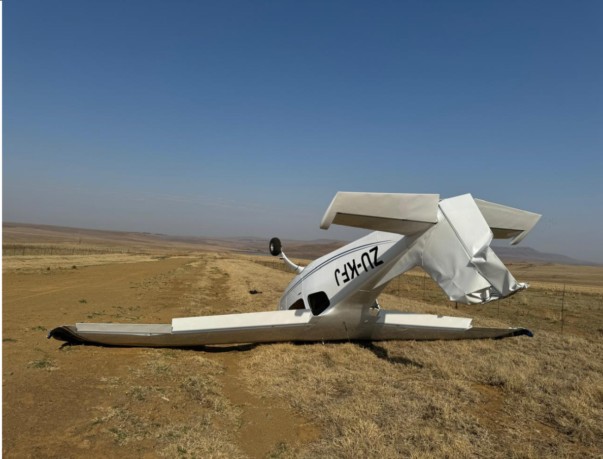
Figure 5: Damage to the tail fin due to impact with the ground.

Figures 3 and 4 illustrate the condition of the runway surface area on which the aircraft landed.