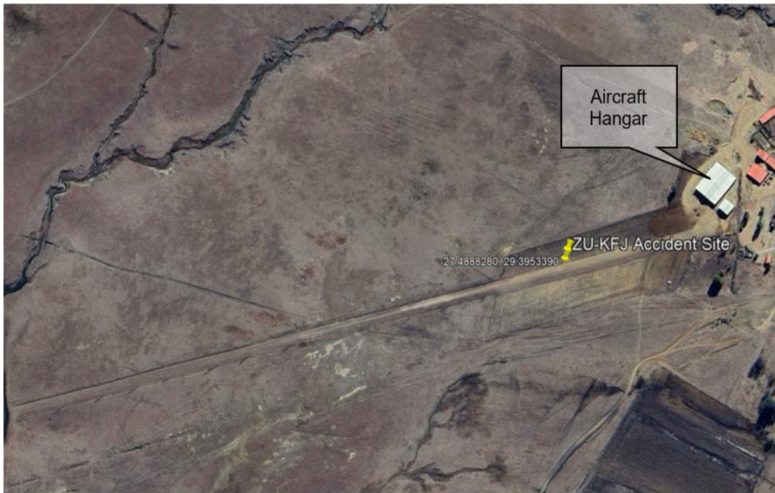
Figure 1: The view of the accident site.