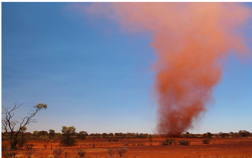
Figure 6: An example of a whirlwind.

A whirlwind is a rapidly rotating column of air that can be small in diameter and last from minutes to hours. These winds are caused by turbulence and instabilities created by heating and flow gradients. A whirlwind can occur anywhere on earth irrespective of the season. They are often seen in dry, open areas.