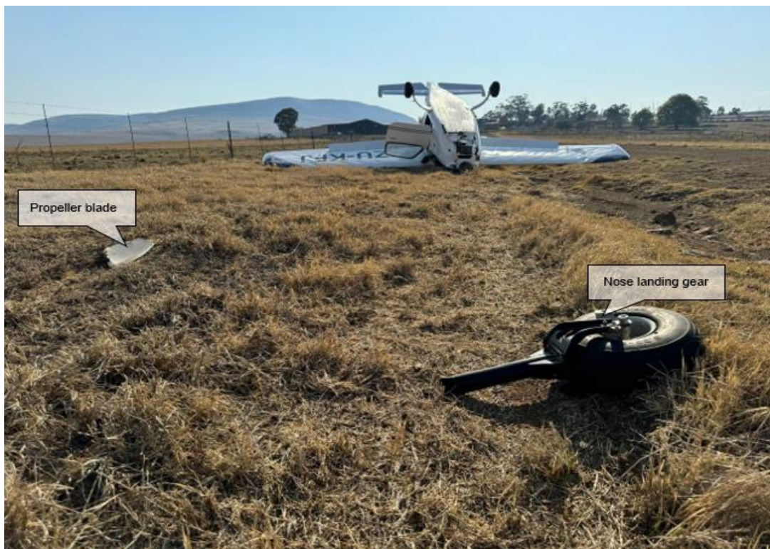
Figure 2: The aircraft's resting position after the accident.