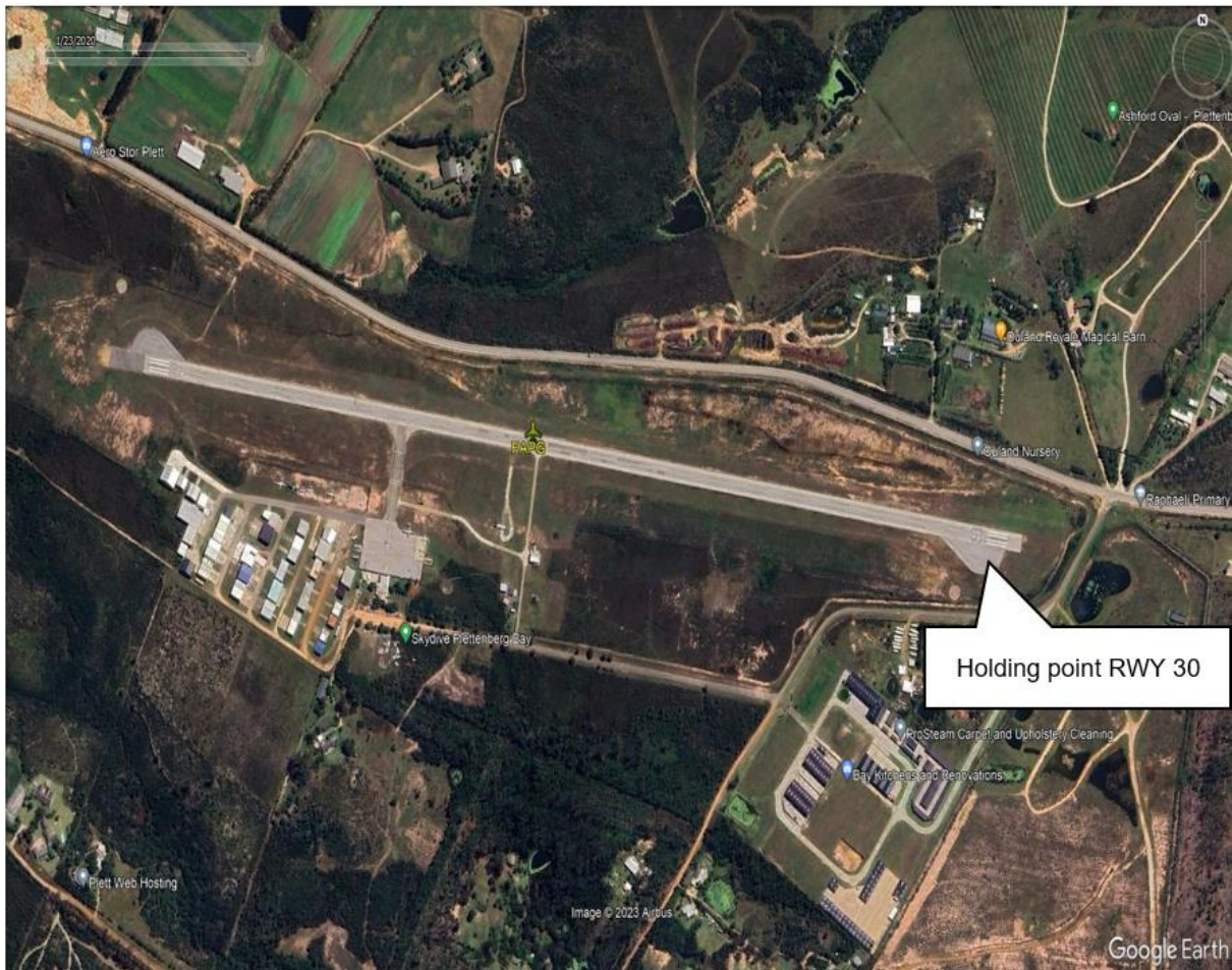
Figure 2: Aerial view of Plettenberg Bay Airfield.

The serious incident occurred on RWY 30 at FAPG in visual meteorological conditions by day.