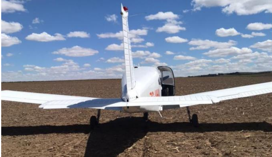
Figure 3: The rear view of the aircraft.