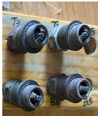
Figure 6: Greyish deposits.