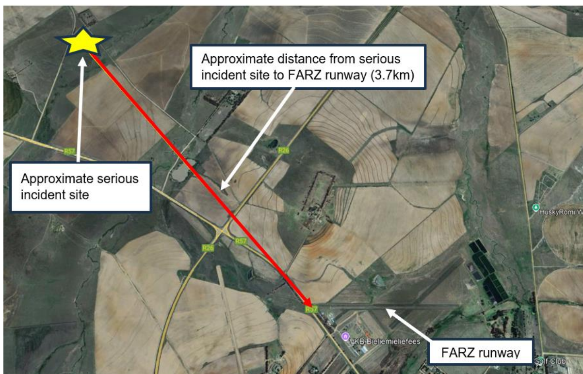
Figure 1: Aerial view of FARZ Airfield and the distance from the serious incident site.

The serious incident occurred during daylight at Global Positioning System (GPS) co-ordinates determined to be 27°45'32.51" South 28°23'49.90" East, at an elevation of 5 275 feet (ft).