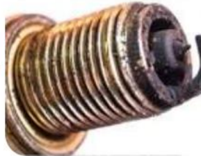
Figure 5: Brown deposits.

A normal spark plug would have brown or greyish deposits on the side electrode.