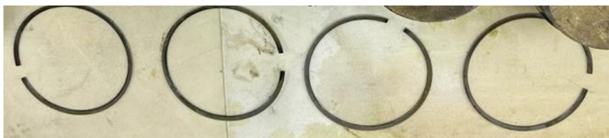
Figure 8: Worn oil control rings.