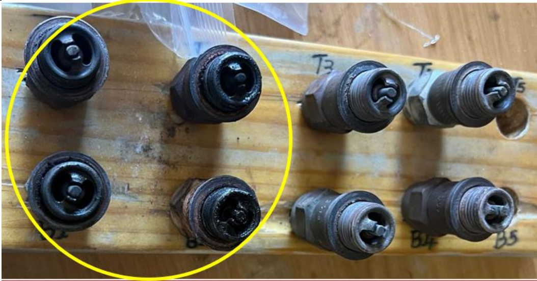
Figure 4: The yellow circle indicates the fouled spark plugs.

A normal spark plug would have brown or greyish deposits on the side electrode.