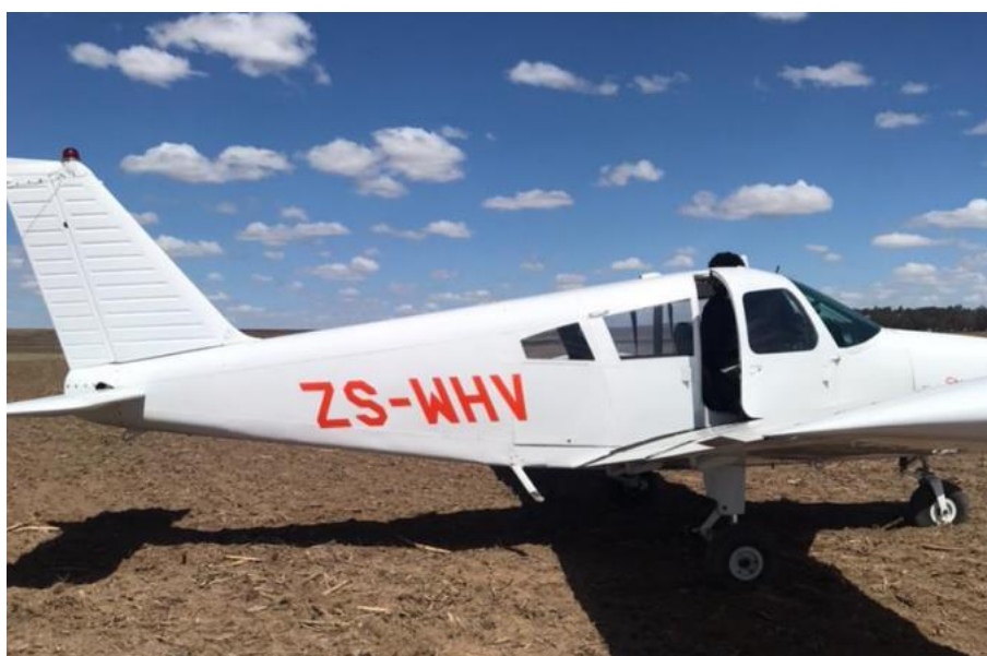
Figure 2: The right-side view of the aircraft at the accident site. (Source: Pilot).