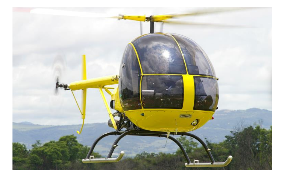
Figure 1: The Sanka AK 1-3 helicopter.