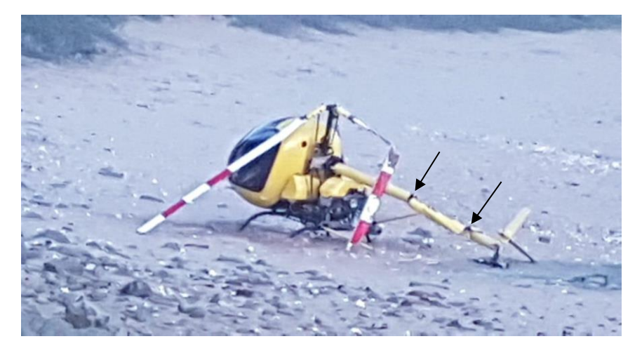
Figure 2: The helicopter as it came to rest on the beach.