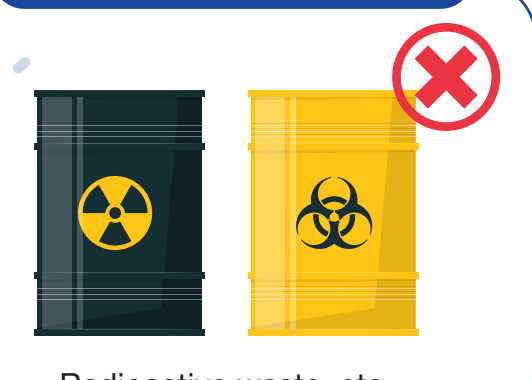
Radioactive waste, etc.