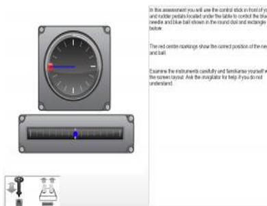
Eye hand foot coordination test – COMPASS pilot Selection

COMPASS test results show a score for each tested skill.