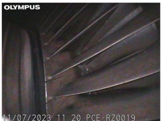
2<sup>nd</sup> stg. P.T. blade condition with light thermal coating deterioration and light surface corrosion. Foreign debris observed forward of 2<sup>nd</sup> stg. PT. blades.