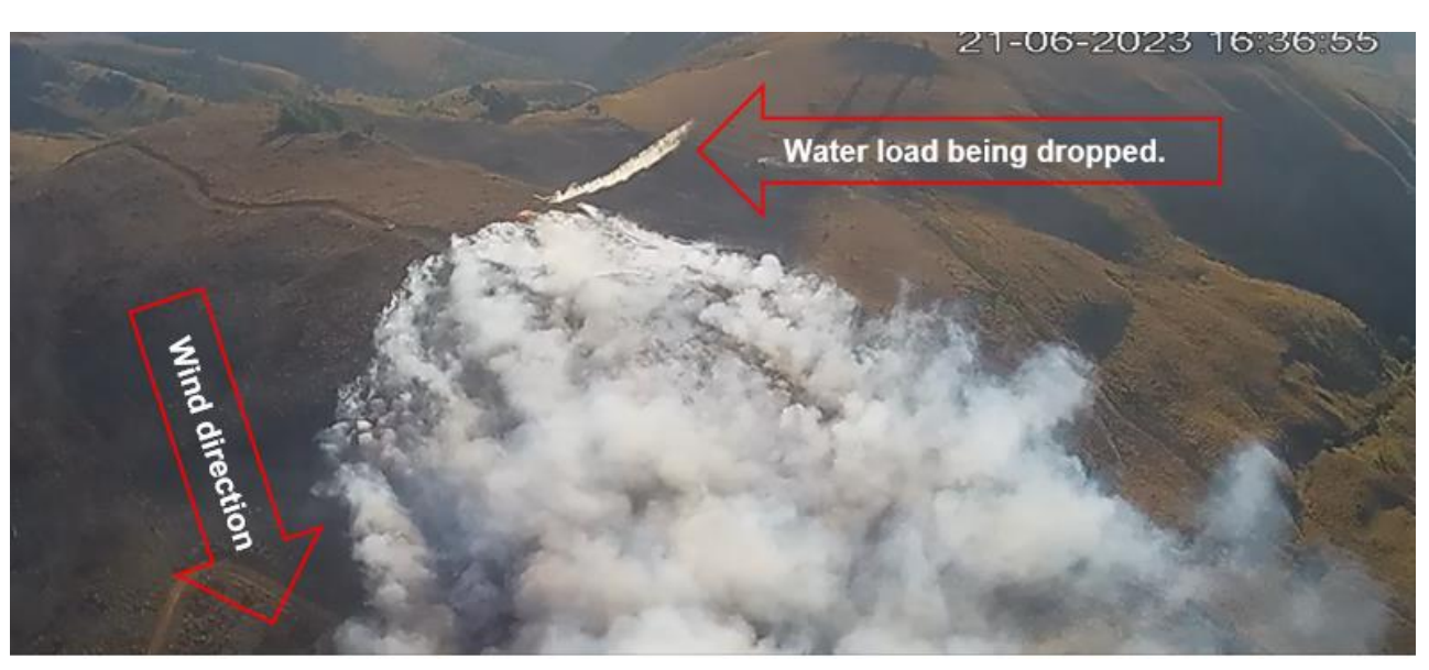
Figure 7: Wind direction at the time ZS-TFH released water on the fire line.

1.12.3 The aircraft was flying perpendicular to the wind direction (see Figure 7 below).