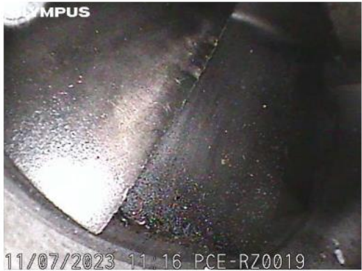
1<sup>st</sup> stage compressor blade condition with light levels of erosion and oil wetness observed. Foreign debris observed.