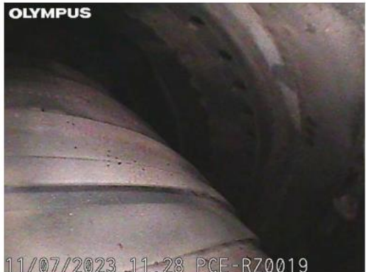
Combustion chamber with light thermal erosion and foreign debris observed.