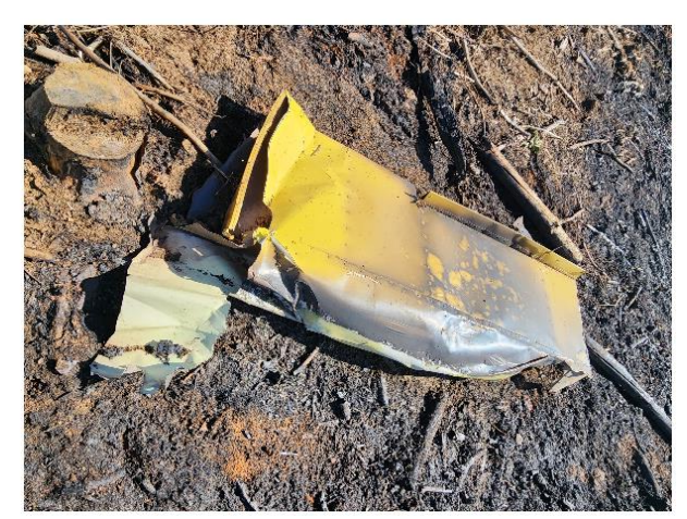
Figure 12: The right-side aileron with the trim tab missing. Figure 13: Shows the left-side aileron with the trim tab still attached.

1.12.6 The jackscrew was found in an open position, an indication that the flaps were extended (down).