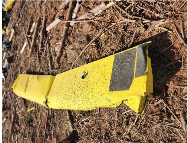
Figure 10 and 11: Shows bottom and top view of the right-side flap.

1.12.5 The left and right ailerons broke off from the wing trailing edge during the accident sequence.