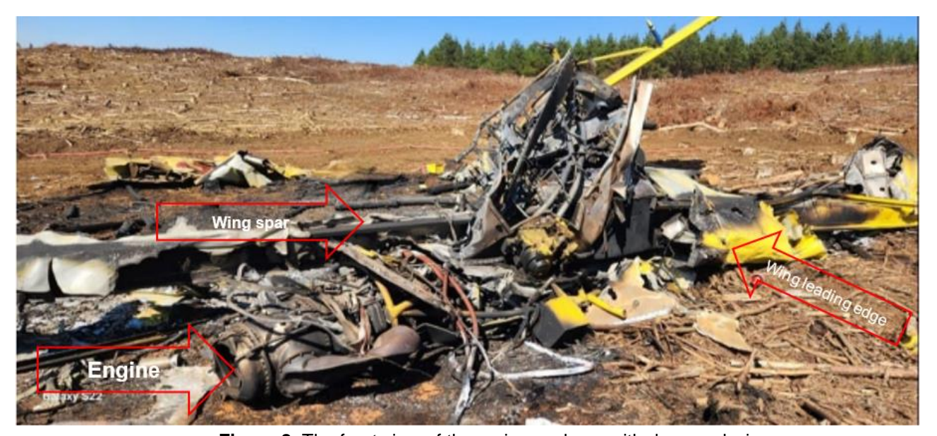
Figure 8: The front view of the main wreckage with damaged wings.