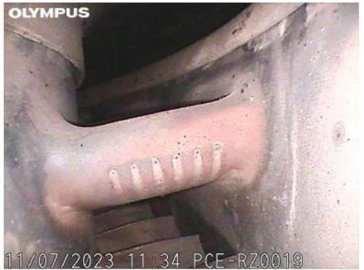
C.T. vane condition with light thermal coating deterioration, dirt build-up and light cracking