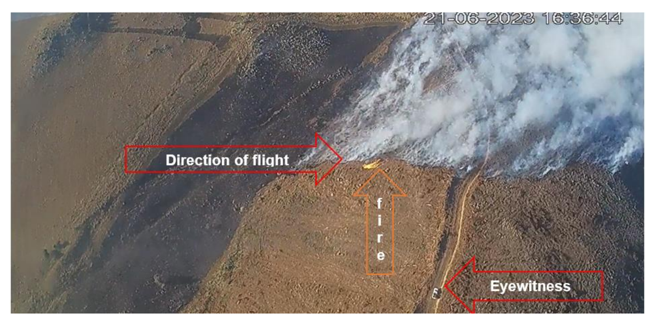
Figure 6: The direction of flight, the area that was on fire (pre-existing) and position of the eyewitness.

1.12.2 Both main landing gears and the hopper separated from the fuselage and dispersed in the direction in which the aircraft catapulted. The tail wheel remained attached to the main wreckage. The wings were damaged by impact forces but remained attached to the fuselage. The flaps and ailerons separated from the wings.