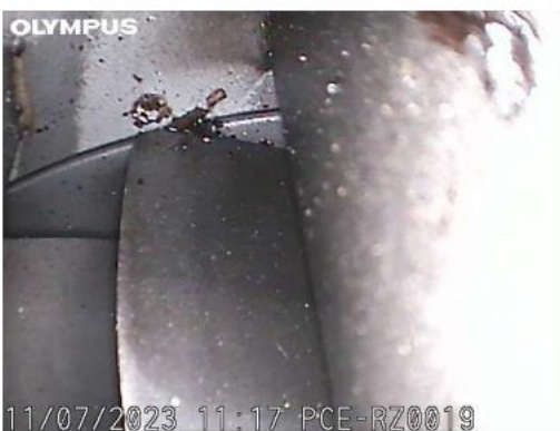
1<sup>st</sup> stage stator with light L.E. erosion and dirt build-up observed. 2<sup>nd</sup> stage comp. blade condition with light L.E. erosion observed. Foreign debris observed in 2<sup>nd</sup> stg. compressor area.

Hot Section: Access through the fuel nozzle ports was used to inspect the compressor turbine blades, shroud segments, compressor turbine vane ring, small exit duct, fuel nozzles and C.C. liner. C.C. liner condition in fair condition with multiple spots of thermal erosion with coating loss on cooling ring and with carbon build-up observed. The compressor turbine blades were found in fair condition, with dust build up and light thermal erosion observed. C.T. shroud segments found in fair condition with light levels of thermal erosion observed. Compressor turbine vane ring was found in fair condition with light coating deterioration, dust build-up and one outer wall crack onto vane L.E. observed. S.E. Duct was found in a good condition with light thermal coating deterioration observed. Fuel nozzles inspected and found in good condition with light carbon build-up around the sheaths. 2<sup>nd</sup> stg. P.T. blade condition with light thermal coating deterioration and light surface corrosion observed. Evidence of dirt and debris contamination observed throughout the hot section area.