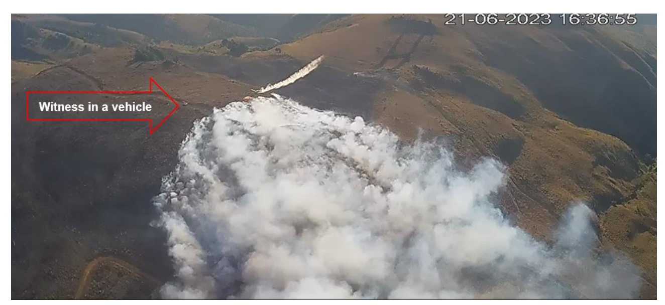
Figure 1: ZS-TFH as it released its second load of water.