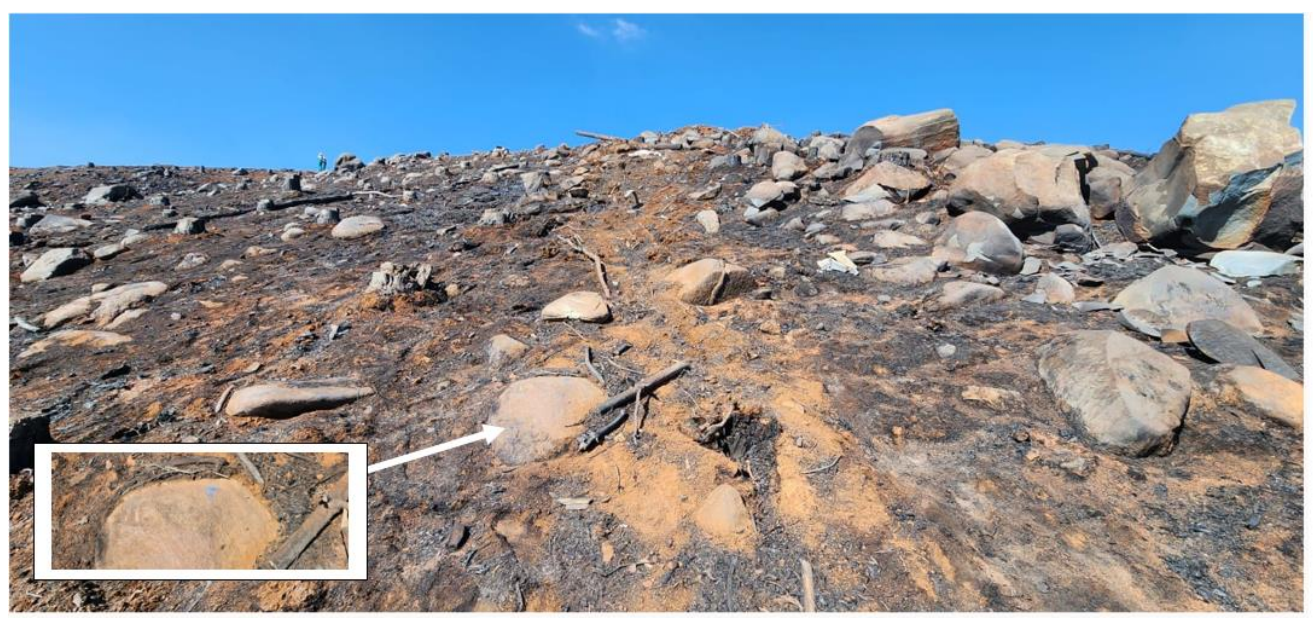
Figure 5: A blue paint mark on the rock that the aircraft's hopper impacted.

1.12.1. The aircraft impacted the rising terrain and dispersed in a radius of 350m. The aircraft impacted the terrain with the left-side main landing gear and the hopper and then burst into flames. It catapulted forward for approximately 250m before it came to rest in an inverted position facing north.