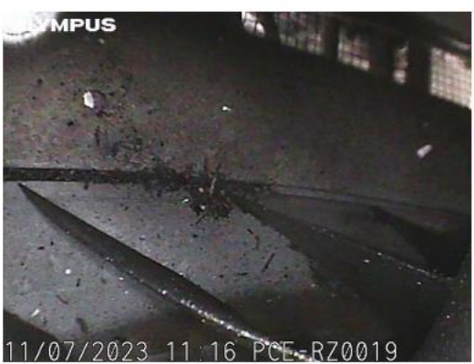
Compressor inlet housing condition with areas moderate coating deterioration and associated coating loss. Evidence of foreign debris observed (Grass, sand/dirt etc..).