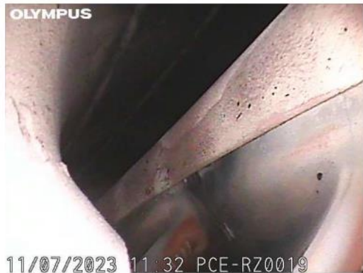
SED. condition with light thermal deterioration, coating loss and dirt build-up. Foreign matter observed.