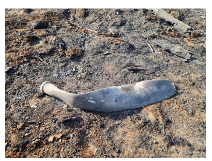
Figures 15, 16 and 17: Three of the five propeller blades were recovered at the accident site.