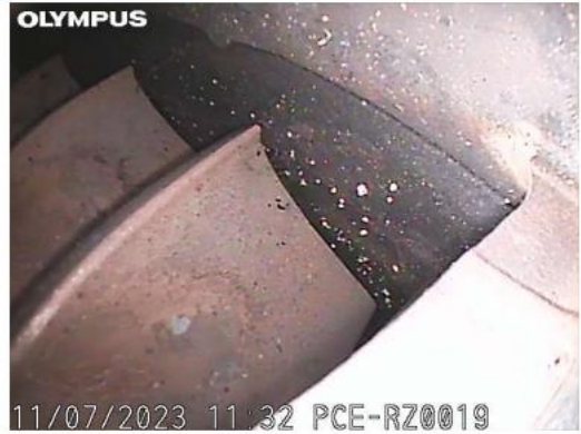
C.T. blade and segment condition with light erosion and dust build-up observed. Foreign debris observed in CT. area.