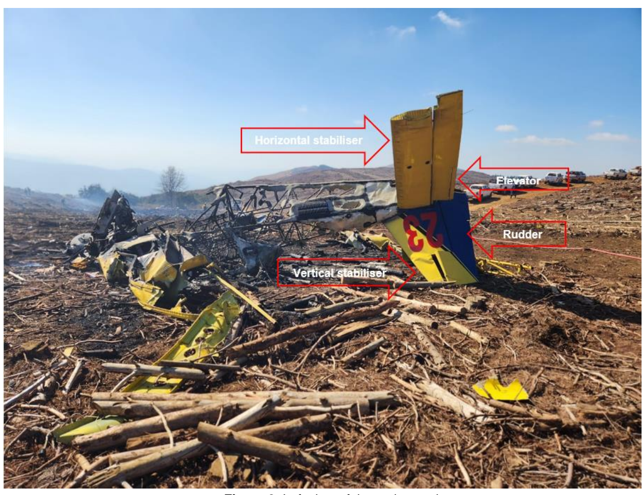
Figure 9: Left view of the main wreckage.

1.12.4 The right-side flap was found approximately 10m from the main wreckage; it was severed before the aircraft came to rest.