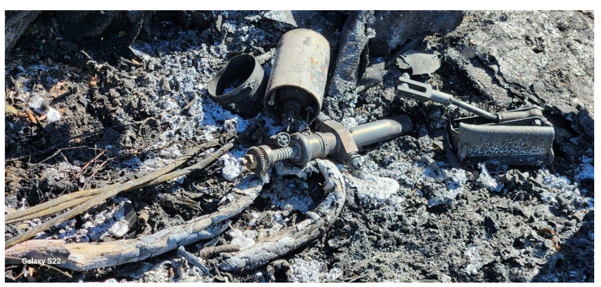
Figure 14: The open flap jackscrew.

1.12.6 The jackscrew was found in an open position, an indication that the flaps were extended (down).