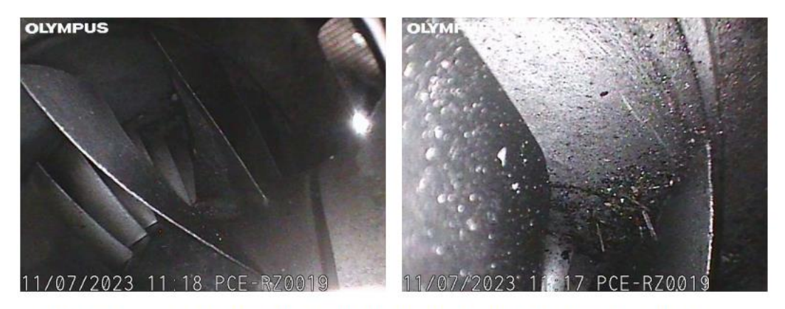
1st stage compressor blade condition with light levels of erosion and oil wetness observed. Foreign debris observed.