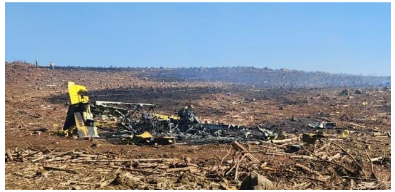
Figure 3: The wreckage post-accident.