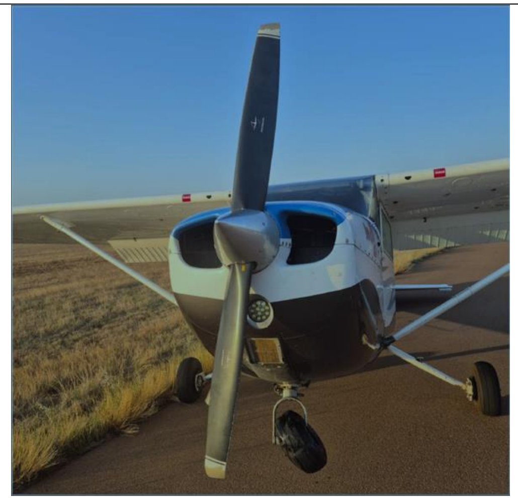
Figure 2: Damage sustained to the nose gear and the propeller blades.

The meteorological aerodrome report (METAR) was obtained from the South African Weather Service (SAWS), issued for FAWB on 16 October 2024 at 1500Z. FAWB 161500Z 03008KT CAVOK 23/08 Q1022=.