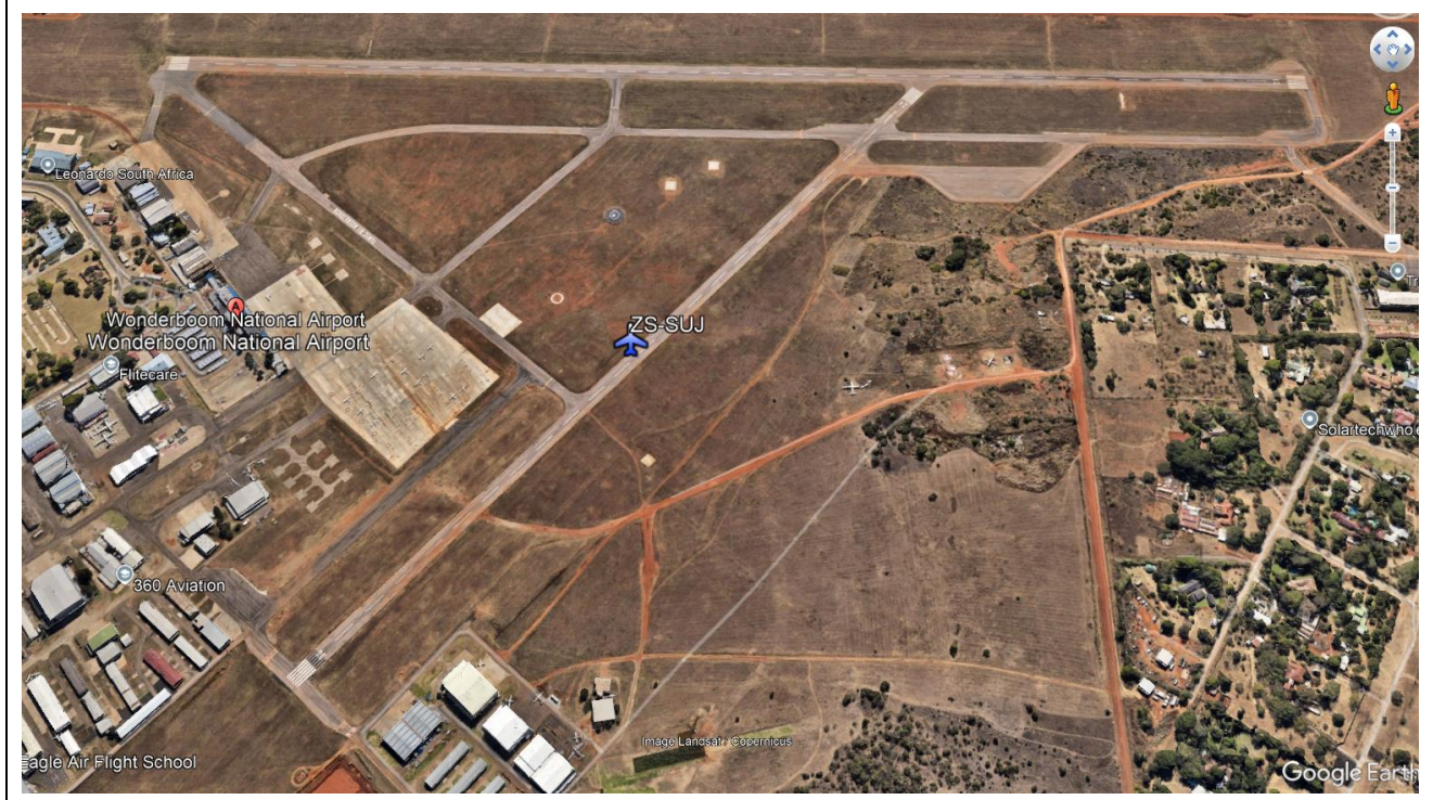
Figure 1: An overview of the accident site.

The SP turned off the master switch and exited the aircraft; he was not injured. The aircraft sustained substantial damage.