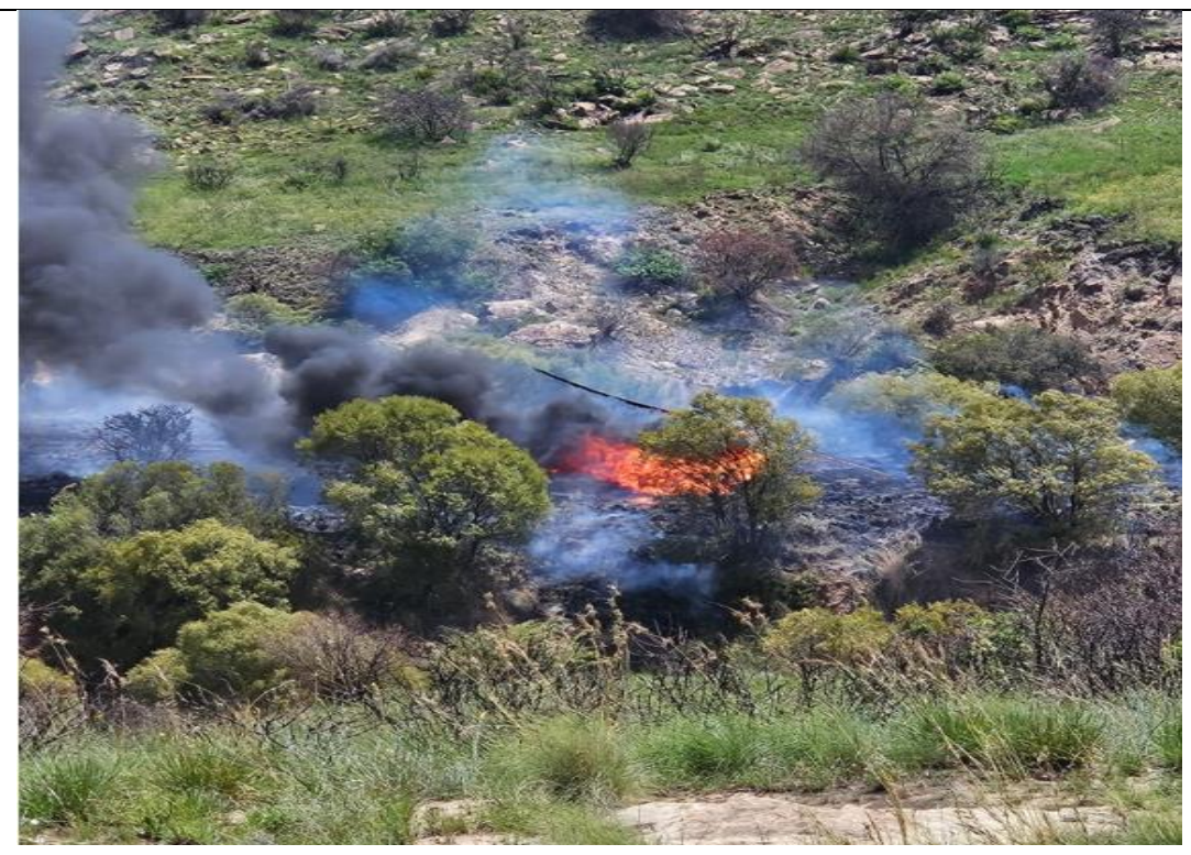
Figure 1: The helicopter engulfed in flames.

The picture above was taken by the pilot after all their efforts to extinguish the fire were exhausted. The fire also rapidly spread across a large portion of the accident site.