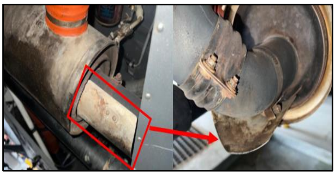
Figure 5: The muffler shield on the right side of the helicopter (left) and a muffle taken from a different angle (right).

Figures 5 and 6 show a R44 helicopter type fitted with both the muffler and the tailpipe shield kits.