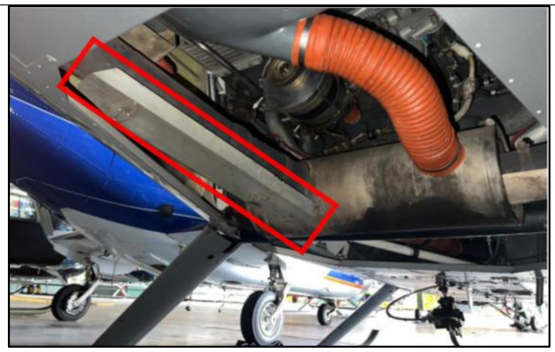
Figure 6: The red window shows a tailpipe shield.

Previous records of similar occurrences on different aircraft were also noted.