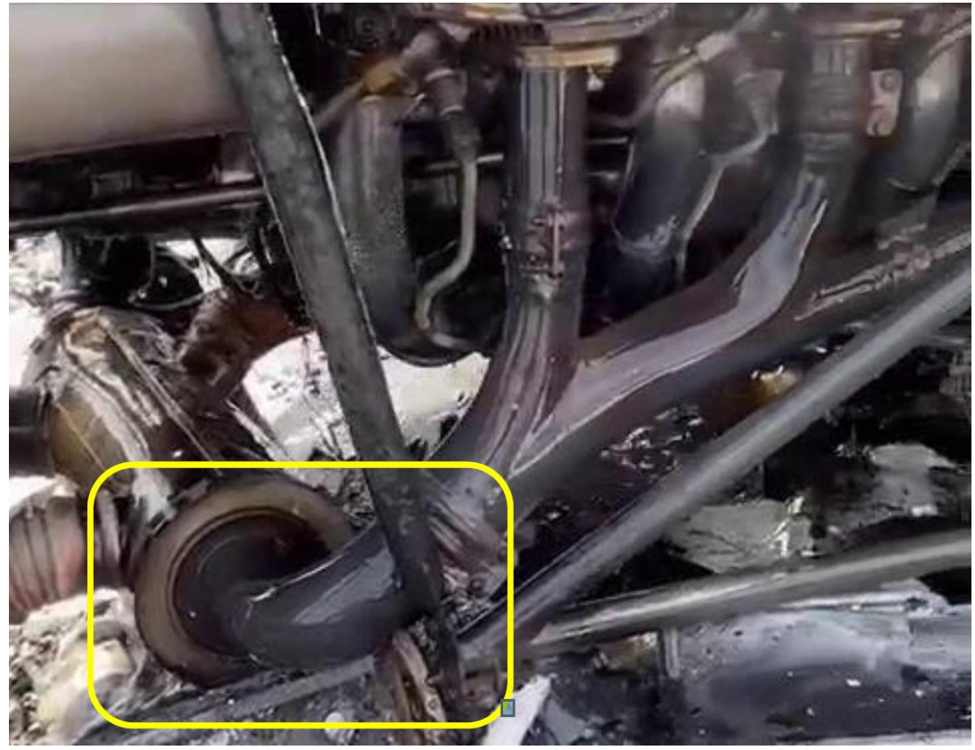
Figure 3: Similar exhaust system to the accident helicopter.

The investigation (to this accident) revealed that there was no compliance with Service Bulletin-46 (SB-46) as the muffler and the tailpipe shield were not fitted to the helicopter.