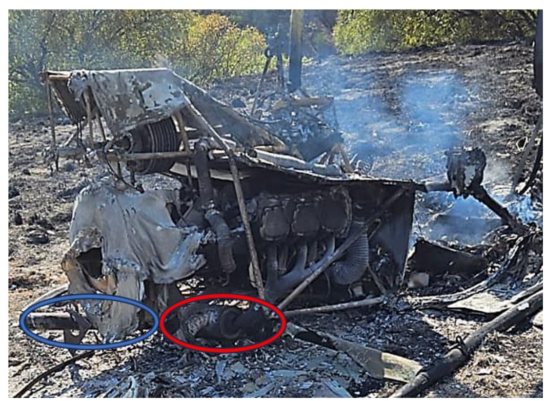
Figure 2: The wreckage. The blue circle shows the exhaust tailpipe (blue circle), and the red circle depicts the exhaust pipeline (red circle) with no shield and muffler.

The picture above was taken by the pilot after all their efforts to extinguish the fire were exhausted. The fire also rapidly spread across a large portion of the accident site.