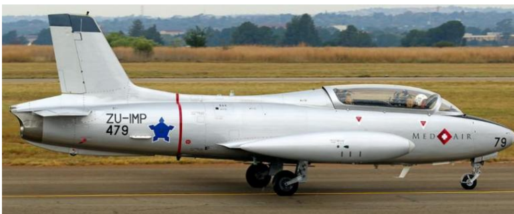
Figure 11: The file picture of the ZU-IMP aircraft.

1.6.1. The Impala Mk I is a tandem-seat jet trainer powered by a single Viper-22 (Armstrong-Siddeley) turbojet engine. It features a low-wing configuration with a straight-wing design optimised for stability and ease of handling. The aircraft is also equipped with a tricycle landing gear, which enhances ground handling and pilot visibility. Originally developed in Italy by Aermacchi, it was later produced under license by Atlas Aircraft Corporation in South Africa. The Mk I variant was primarily used for pilot training.