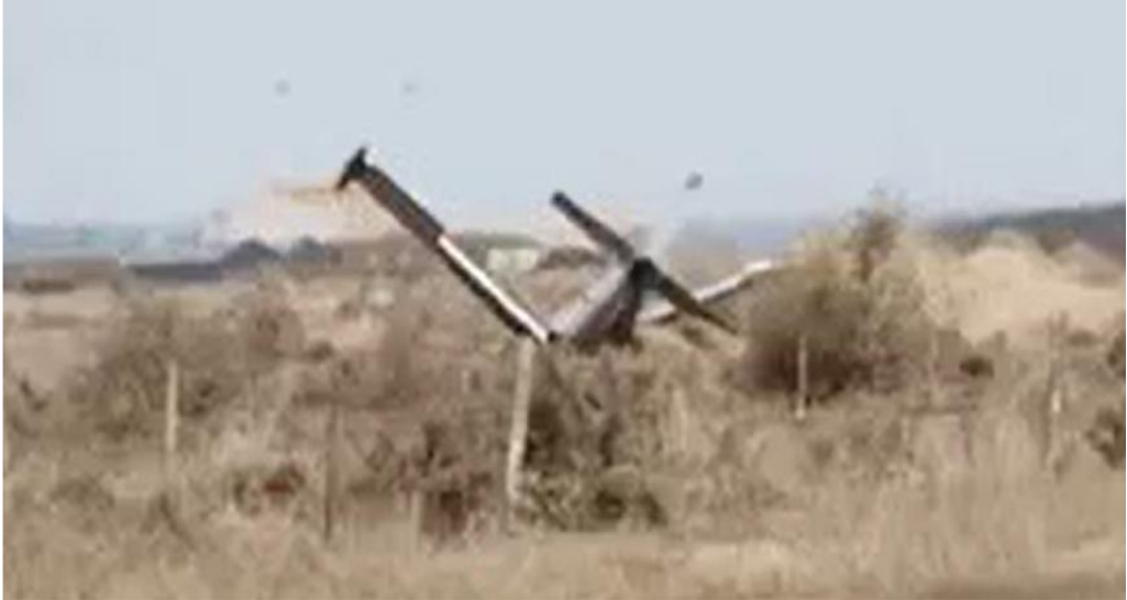
Figure 5: The aircraft impacts the ground. (Source: Airshow video footage)