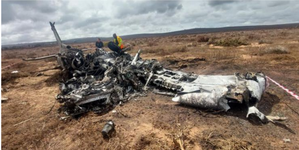
Figure 10: The wreckage after the fire was extinguished.