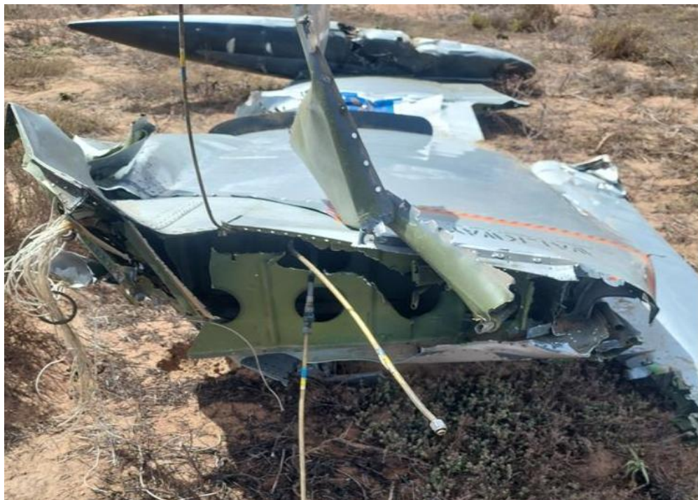
Figure 15: The right wing showing structural failure and the damaged hydraulic line.

1.12.5. The right wing separated from the main fuselage when the aircraft skidded after the crash. The wing skin was severely torn, exposing internal components including ribs and spars. Jagged and bent metal edges suggested a high-stress separation after high impact with the ground; it was located approximately 60m behind the main wreckage which suggested that it detached due to impact forces or structural failure as the aircraft was still in motion on the ground. The position of the wing, in relation to the rest of the wreckage, indicated that it might have broken off whilst the aircraft was tumbling forward.