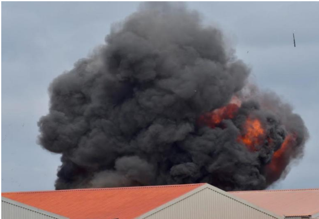
Figure 8: Thick smoke billowing from behind the hangars.

1.1.9. The second eyewitness who was with the Flight Command Committee at the airshow stated: “I glanced at the marksmen display and the next act was the Impala ZU-IMP aircraft. I handed the display sequence which the pilot had given during the briefing to the Flight Display Safety Officer (FDSO). As far as I can remember, it was before 1300Z when the pilot commenced the display. During the performance, the aircraft did a flypast from left to right, followed by a turn and another flypast from right to left. I observed the pilot perform a roll during which the undercarriage was visible. Afterward, it appeared (as though) the pilot rolled back, and the nose of the aircraft pointed downward as it began to lose altitude. I then saw the aircraft fly over the hangars, and the next moment, an explosion occurred, followed by thick smoke. The FDSO activated the Joint Operation Centre (JOC), I overheard someone nearby mention that it was 1259Z. The crash alarm was activated, and emergency services were dispatched. Despite the swift response, the pilot succumbed to his injuries and the aircraft was destroyed.”