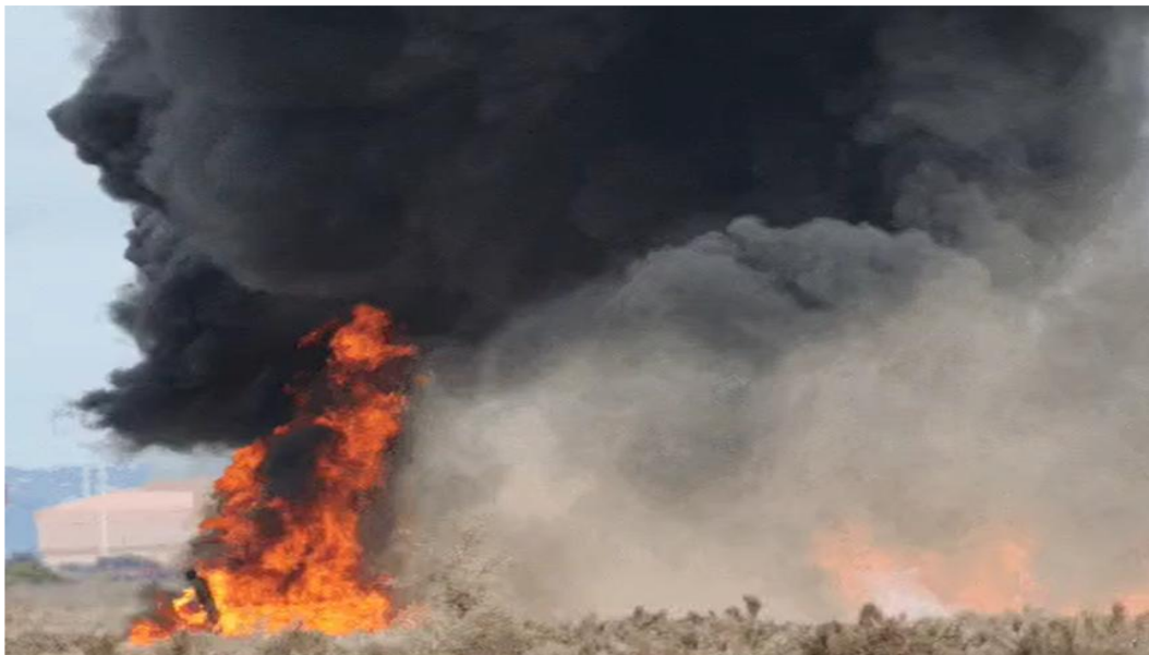
Figure 7: Post-impact fire eruption.