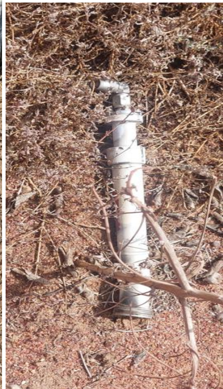
Figures 19 and 20: The rocket motor assembly which was not fired (left), and one that was fired (right).