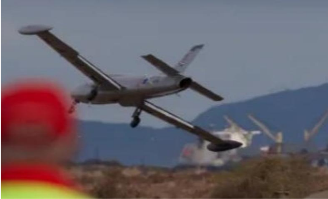
Figure 3: The right wing dipping right.