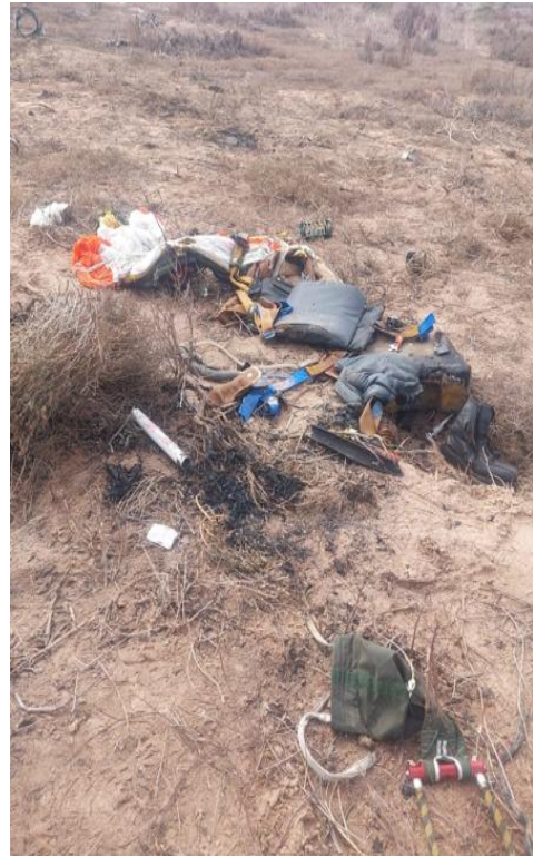
Figures 17 and 18: The front and the rear seat.

1.12.8. Examination of the wreckage and available evidence did not reveal an attempt made to activate the ballistic recovery system.