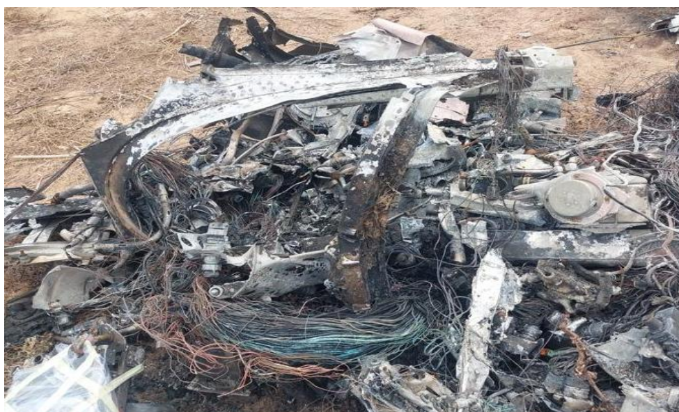
Figure 21: The cockpit structure.

1.15.2. The pilot was equipped with the required safety equipment, including a fire suit and helmet, at the time of the display.