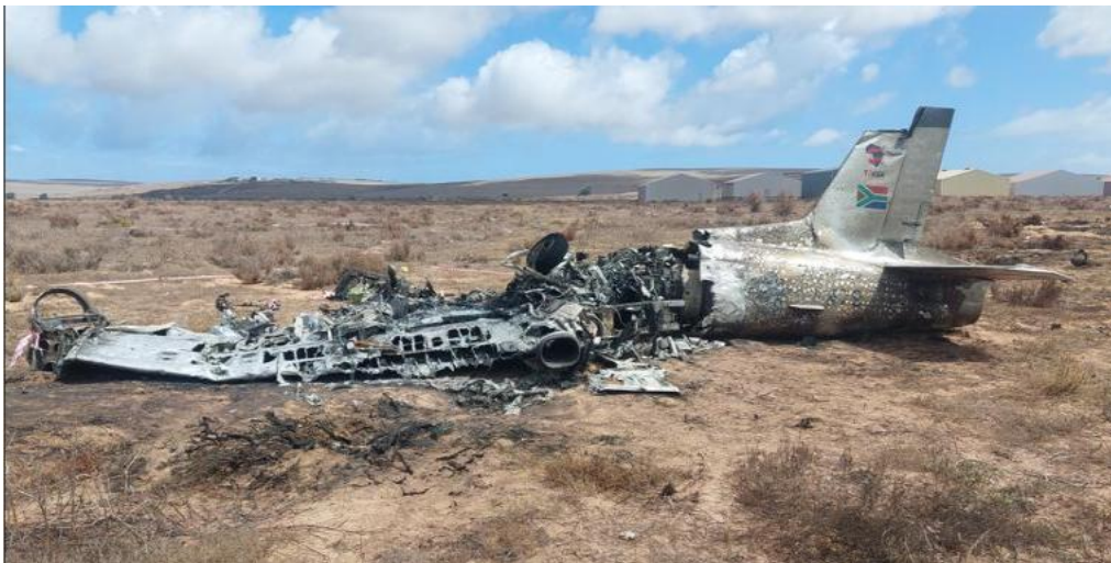
Figure 13: The wreckage post-accident with hangars in the background.

1.12.3. The aircraft impacted the ground with the right wing first. It skidded approximately 130m from the first point of impact to its resting position, where it rested on its belly. The resting position was oriented 175 degrees magnetic heading. Approximately two-thirds of the airframe was destroyed because of the impact. The post-impact fire consumed the fuselage from the nose to the mid-section. The detached components were found scattered along the impact trajectory which suggested that they had separated from the aircraft either during the initial impact or as the wreckage travelled (tumble) forward.