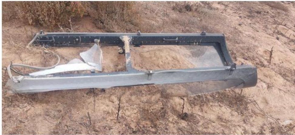
Figure 14: The recovered jettisoned canopy.

1.12.5. The right wing separated from the main fuselage when the aircraft skidded after the crash. The wing skin was severely torn, exposing internal components including ribs and spars. Jagged and bent metal edges suggested a high-stress separation after high impact with the ground; it was located approximately 60m behind the main wreckage which suggested that it detached due to impact forces or structural failure as the aircraft was still in motion on the ground. The position of the wing, in relation to the rest of the wreckage, indicated that it might have broken off whilst the aircraft was tumbling forward.