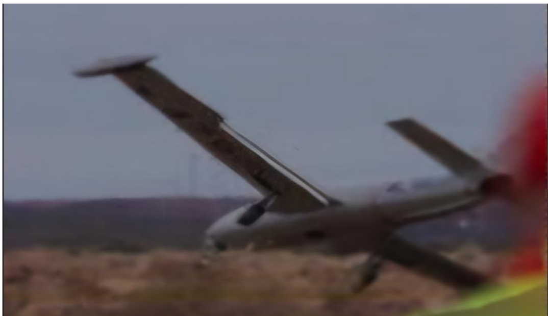
Figure 4: The right wing impacts the ground.