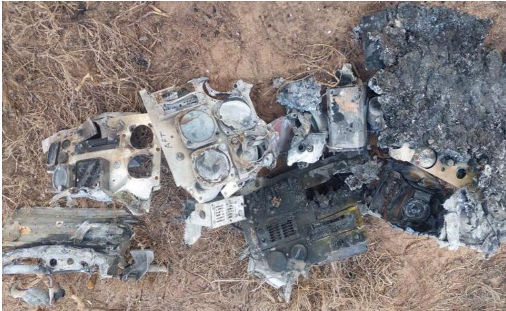
Figure 16: The damaged instrument panels.

fire. The burn patterns on the aircraft were uneven due to heat exposure, with some instruments retaining partial structure whilst others were destroyed. Most dials, screens and switches were either missing, warped or burnt beyond recognition. Some circular instrument housings remained intact, but their glass and internal mechanisms were either shattered or melted. The right-most section was almost entirely reduced to ashes, which suggested higher heat concentration. The instrument panel was fragmented, which meant that it broke upon impact. The level of fire damage suggested that the cockpit was engulfed in flames post-impact, likely caused by residual fuel or electrical system ignition.