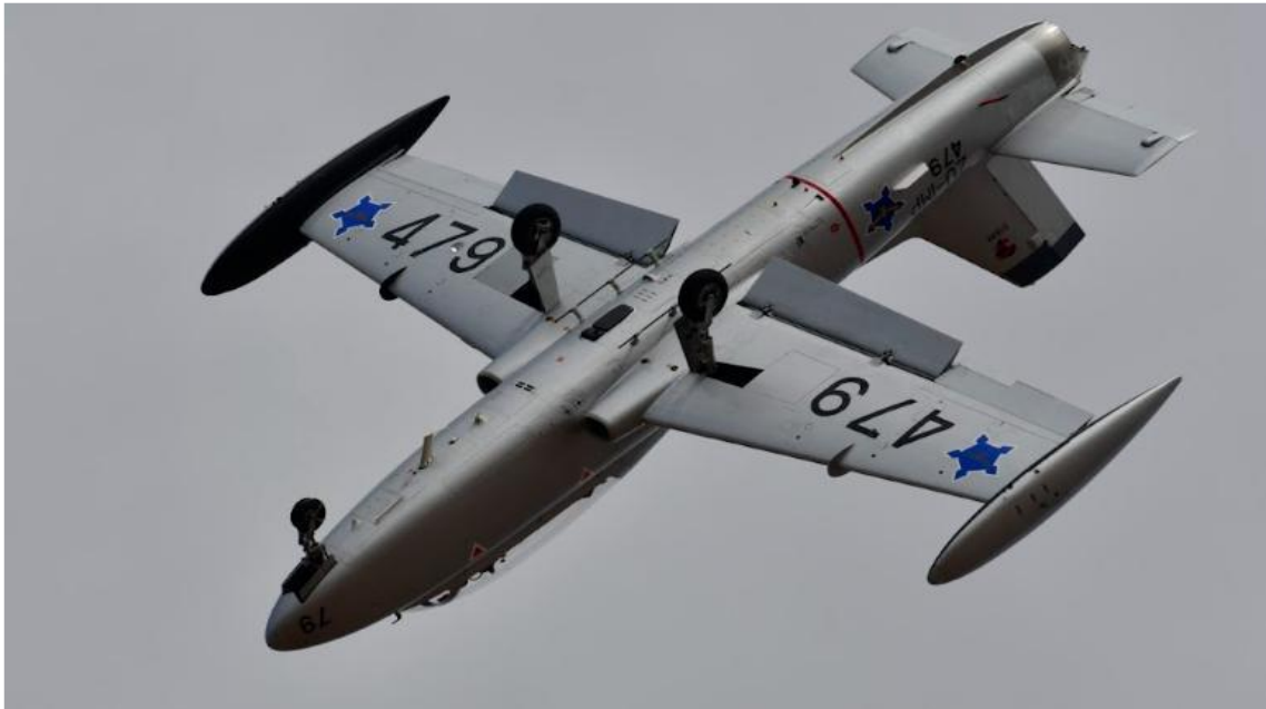
Figure 1: The aircraft in a nose-down attitude with the undercarriage and flaps extended (dirty roll manoeuvre).