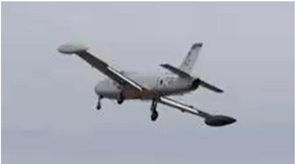
Figure 2: The right wing begins dipping to the right.