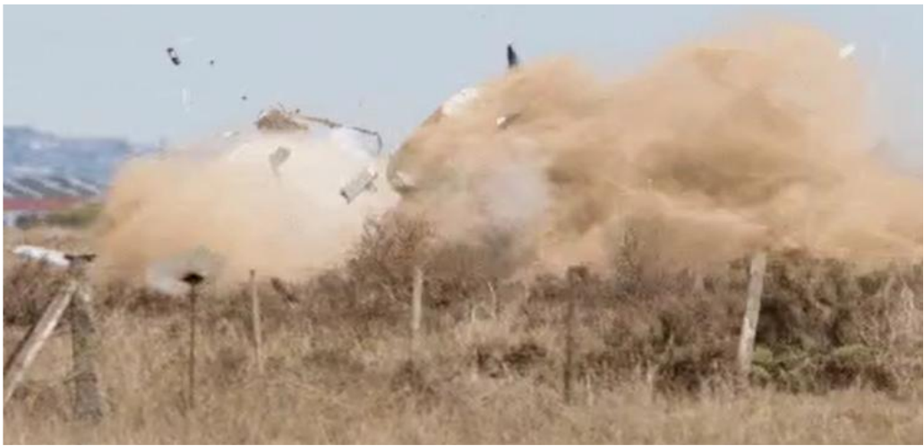
Figure 6: The aircraft disintegrates.