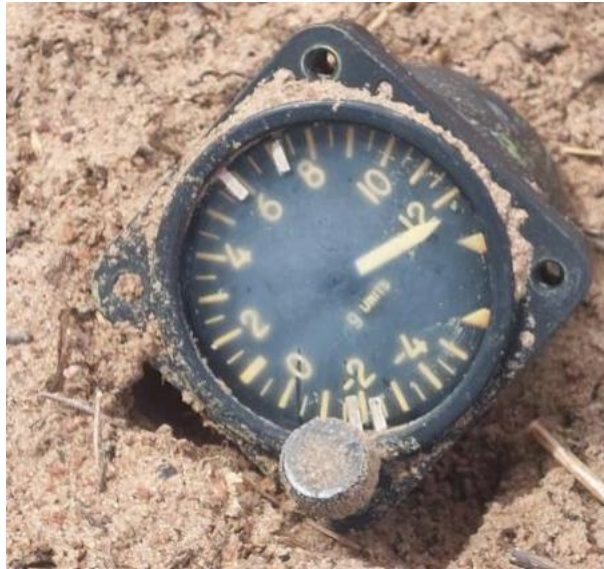
Figure 12: The detached accelerometer (G-meter) found near the wreckage.

1.12.3. The aircraft impacted the ground with the right wing first. It skidded approximately 130m from the first point of impact to its resting position, where it rested on its belly. The resting position was oriented 175 degrees magnetic heading. Approximately two-thirds of the airframe was destroyed because of the impact. The post-impact fire consumed the fuselage from the nose to the mid-section. The detached components were found scattered along the impact trajectory which suggested that they had separated from the aircraft either during the initial impact or as the wreckage travelled (tumble) forward.